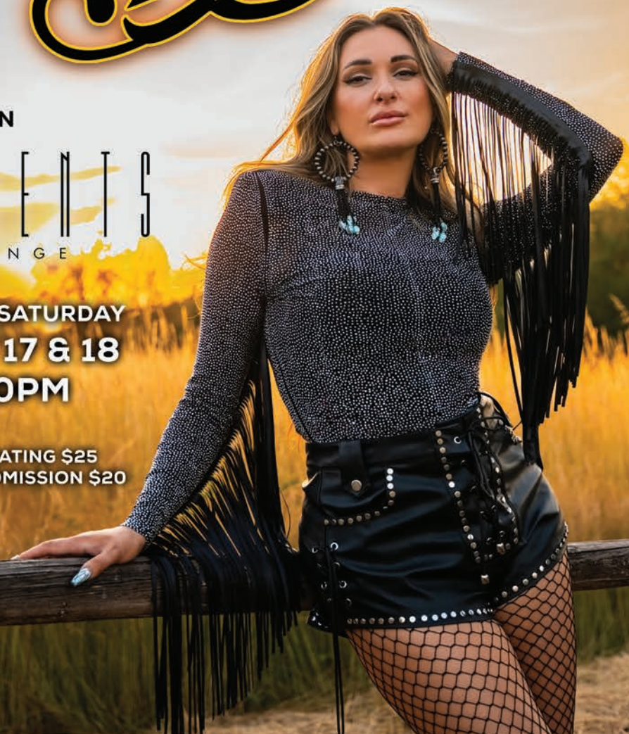
TABLE SEATING $25 GENERAL ADMISSION $20

Doors open one hour prior to show time unless otherwise noted. Must be 21 or older. Concert Attendees - due to venue configuration, standing during the concert can be expected, please be sensitive to the mobility impaired that may surround your seat.